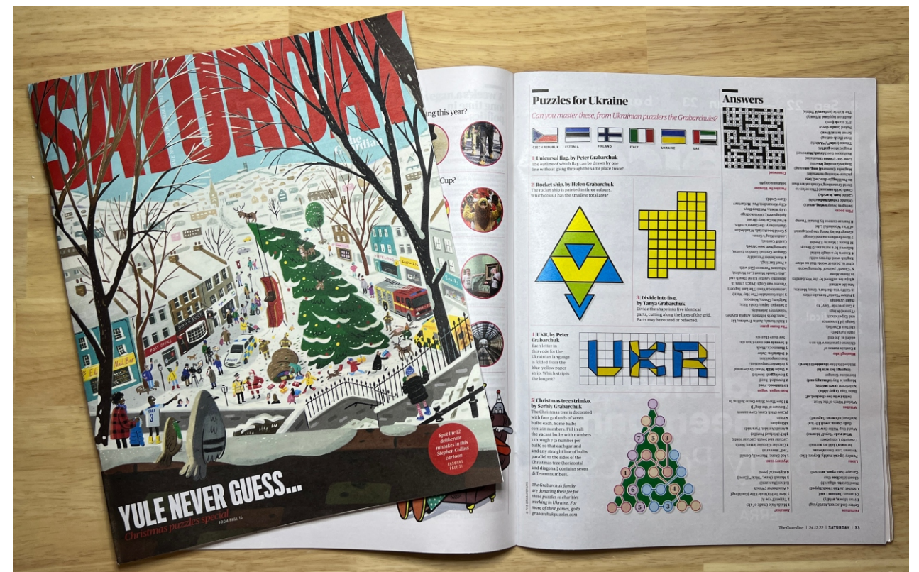
The Guardian newspaper December 2022